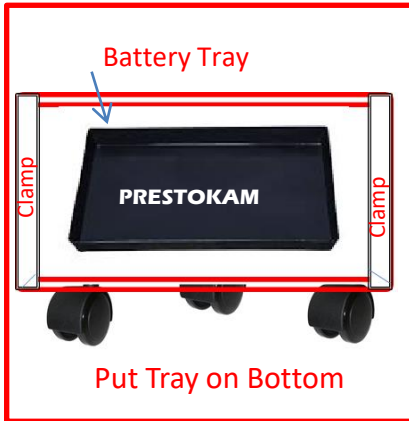
Put Tray on Bottom