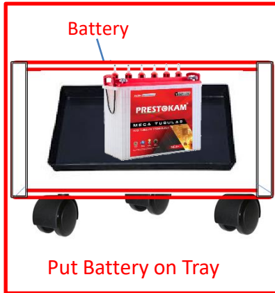
Put Battery on Tray