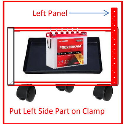
Put Left Side Part on Clamp