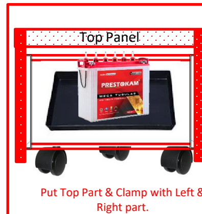
Put Top Part & Clamp with Left & Right part.