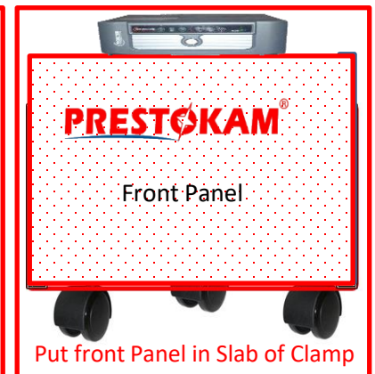
Put front Panel in Slab of Clamp