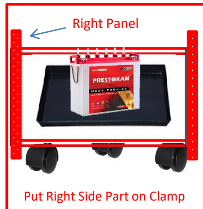
Put Right Side Part on Clamp